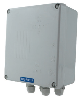
ESR.4 Four way On/Off mains powered receiver