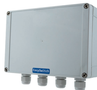
ESR8+8 Receiver with 8 relays. expandable to 16