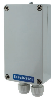
ESR.1 On/Off mains powered receiver