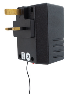
ESB.1 UK style plug-in receiver with bleeper