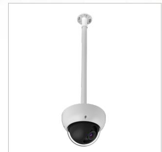
Complete off-the-shelf kits also available (image shows BT5961-FD100)