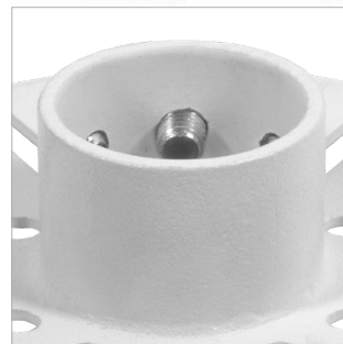
Safety bolt ensures pole and camera mount are securely joined