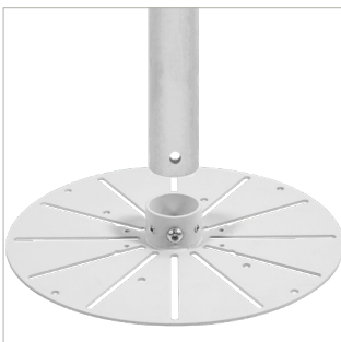
Attaches directly to BT5935 ø38mm poles