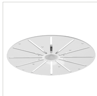
Multiple mounting points for large, domed CCTV security cameras