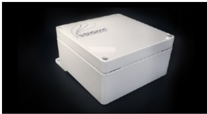
LASCO Outdoor- réf. 1L22003 Décteur outdoor (IP65)