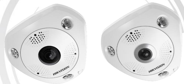
With -V Model