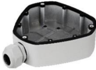
DS-1280ZJ-DM25 Junction Box