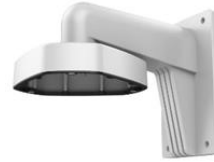
DS-1273ZJ-DM25 Wall Mount