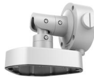
DS-1283ZJ Wall Mount (3-axis Adjustment)